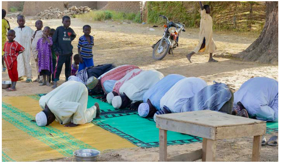
Muslim men in a Chadian village praying to Allah.

We found the celebration of this holiday to be a great opportunity to contextually share the gospel with our Muslim friends. When Eid al-Adha came around, every household that could afford it procured and butchered a sheep or a ram in commemoration of Abraham’s submission to God’s command to sacrifice his son, and God’s subsequent provision of the sacrificial ram. On the day of the celebration, everybody would dress up in their finest clothes. They would gather in the morning as a community for a special “Eid” community prayer. And then the party would start. Our Muslim